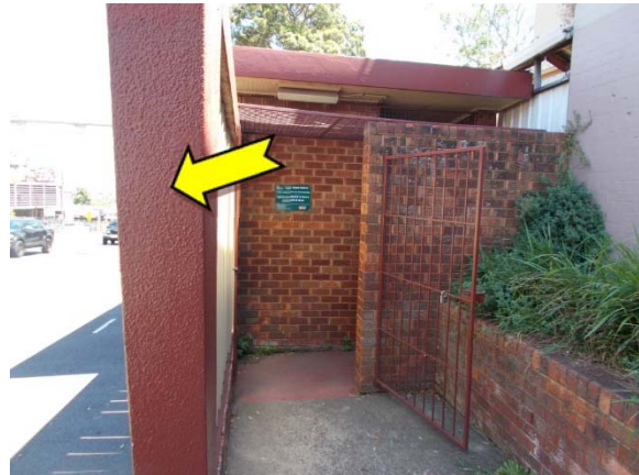
Photo 4. Exterior, throughout, features – suspected lead-containing red upper paint system.