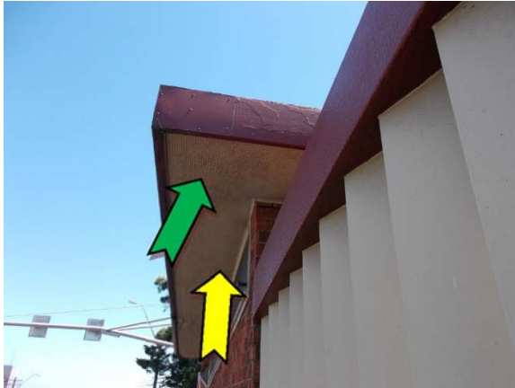
Photo 1. Exterior, throughout, eaves – assumed non asbestos-containing textured coatings; suspected lead-containing cream upper paints; and lead-containing cream lower paint systems.