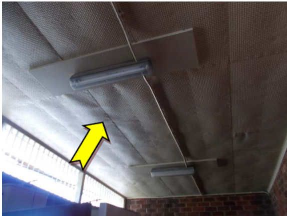
Photo 3. Interior, throughout, single tubed fluorescent light fittings – suspected PCB-containing capacitors.