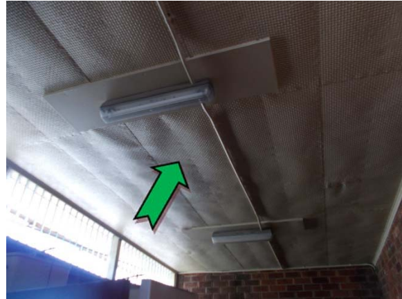
Photo 2. Interior, throughout, ceiling – non asbestos-containing textured coatings; suspected lead-containing cream upper paints; and lead-containing cream lower paint systems.